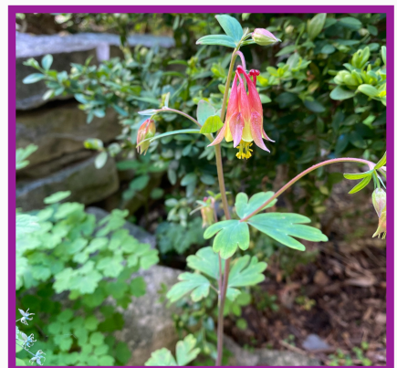
Spring in the church courtyard.