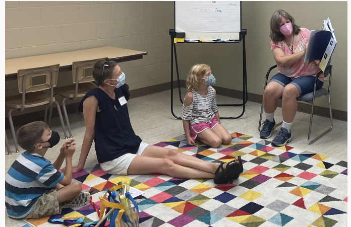
Love Surrounds our 1-2nd graders at story time.