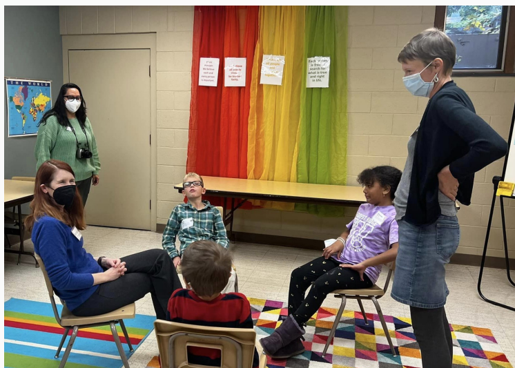
Love Surrounds Us