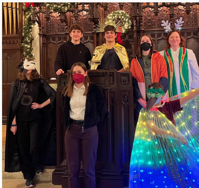
The cast from our 2022 Holiday Pageant on December 18.