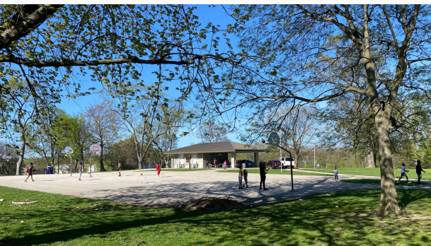
Kern Park Pavillion

If you'd like to attend via Zoom, you must fill out this form by Saturday, May 20.