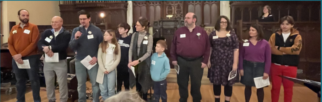
New Members who recently joined in the winter 2024