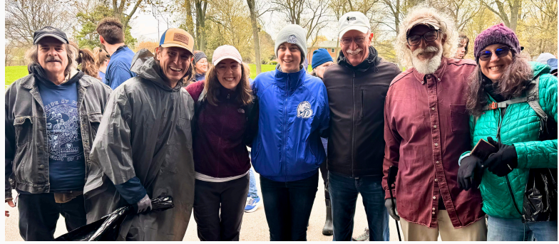
First Church with Milwaukee Riverkeepers cleaning our parks and helping create a World Record!